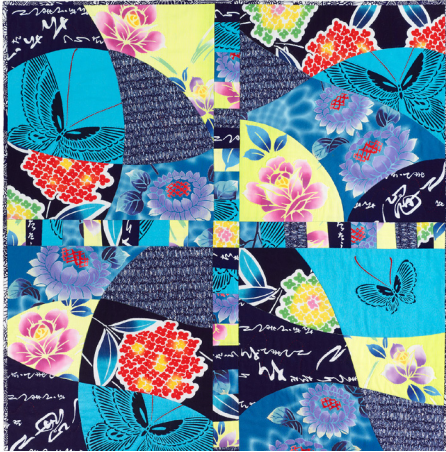
Workshop Example for Project A 36" x 36"

Instructor: Patricia Belyea of Okana Arts