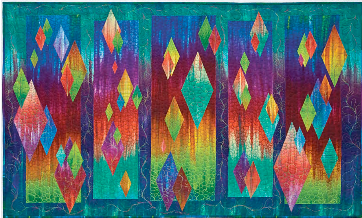
“Aurora” Diamond Abstract art quilt by Jan Krentz, 2008 Rainbow colors & striped border – with set-in corners – 65" x 65" after quilting

Transform a simple 5-panel background with floating appliquéd diamond cut-outs in various sizes to create an artistic wall hanging. Other options include: single, double or triple the background panels to create smaller compositions. Use a variety of embellishment techniques such as foiling, stamping, beading to add pizzazz! Jan's quilt features 3 different colorways of the same gradation printed fabric.