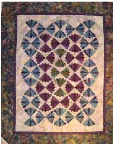
Farfalle – Beginner