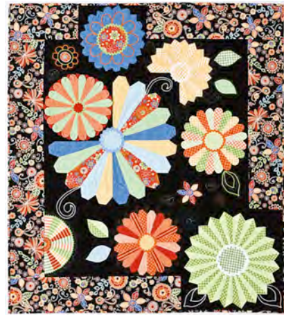
Flower Power Inter – Advanced